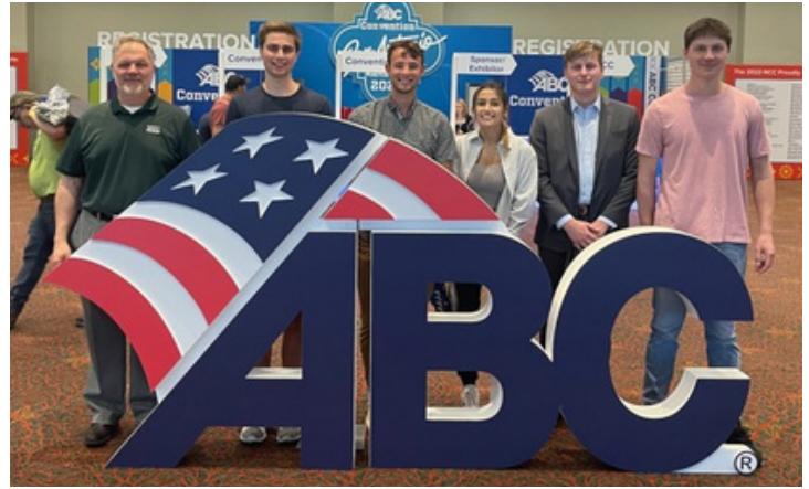
Photo of ABC Competition Team

The 2022 Construction Management Competition was a tremendous experience for the students who also had full conference passes. Many thanks to ABC Greater Michigan Chapter, ABC of Michigan,