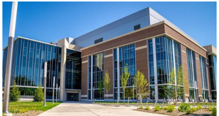
Photo of STEM Facility

Completed in Fall of 2021 on the corner of Shaw Ln and Red Cedar Rd replaces the former Shaw Lane Power Plant. The new STEM Teaching & Learning Facility was constructed with the use of Cross-Laminated Timber. The facility adds 100,000 SF to the campus portfolio and delivered by Granger Construction.