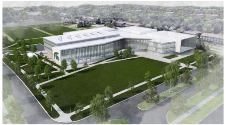
Proposed Rendering of New Rec Center

The main rec center in the middle of campus will be replaced with a new Health, Wellness and Fitness Center. A conceptual rendering can be seen on the right. Construction is expected to take several years and is funded primarily through a new student recreational activity fee.