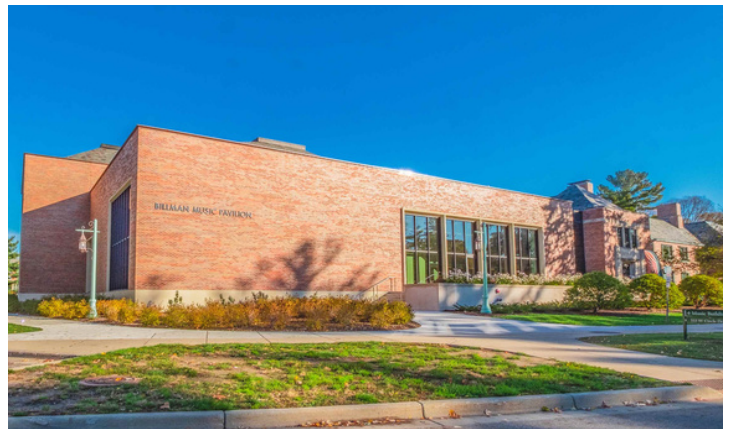
Photo of Billman Music Pavilion

The MSU Billman Music Pavilion added an additional 37,000 SF to the existing College of Music with an additional 8,500 SF renovation to the music practice building. The project, completed in 2020, is located on the north side of the Red Cedar river and was delivered by The Christman Company.